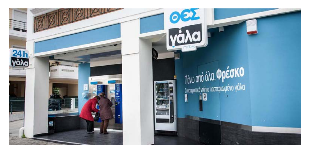
Image 5.6: Vending machine point of THESGALA fresh milk and other products

The establishment of the cooperation coincided with the search for suppliers in Greece by FrieslandCampina (NOUNOU) which is a Dutch cooperative. Thus, the cooperation not only achieved to sell to the large dairy companies their milk in good terms but in addition to that they were able to sell it to the Dutch cooperative. Therefore, the cooperation is now providing its members milk to Friesland, FAGE, Olympos, DELTA, cooperative factories and the Tositsa Foundation for the metsovone it produces.