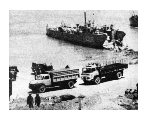
Turkish troops landing in Pente Mili

As far as the Greek side is concerned, plans existed that had been carefully prepared and regularly updated exactly for the defence against a Turkish invasion; they were only partially put into effect.