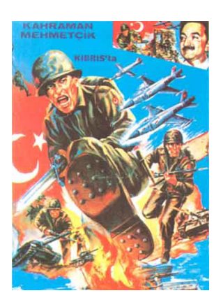
Turkish propaganda poster celebrating the Mehmetcik

It is difficult to explain the lateness with which the National Guard leadership gave the order to open fire on the Turkish Forces. Neither can we easily understand the persistence by which this same leadership kept explaining away the movement of Turkish forces as 'military manoeuvres', just before