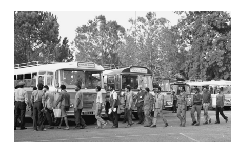
Greek Cypriot POWs return home

all sides and the direct (through telephone diplomacy) involvement of the US Secretary of State, Henry Kissinger, a formal armistice came into a effect on 22 July at 1400 GMT (1600 Cyprus time). The armistice's main aim was to stop the hostilities in Cyprus and thus avoid an all out war between Greece and Turkey, with all the concomitant problems for NATO's south-eastern flank.