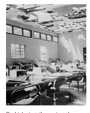
Turkish airstrike against the Nicosia Mental Hospital

On the night of 21 July there was another abortive attempt to reinforce Cyprus from Greece. F/B Rethymnos , a fast civilian ferry was commandeered and embarked a Greek Infantry battalion, a company of medium tanks and about 500 Greek Cypriot volunteers (mainly students studying in Athens). On the night of 22 to 23 July, the ship was ordered to alter its course and go to Rhodes, for reasons as yet unclear (a possible explanation is that by then the armistice in Cyprus had already come into effect). On the other side of the conflict divide, Turkey kept sending a continuous stream of reinforcements to its bridgehead, not only during the fighting but throughout the period of the armistice through to the second phase of the operations in August.