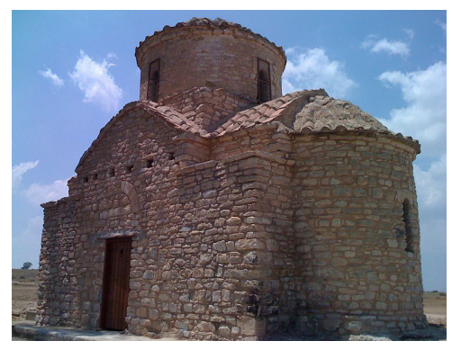
The ancient church of St. Euphemianos in Lysi

Since 965 Cyprus was ruled by Byzantine governors and officials were sent to the island from Constantinople. In a catalog of Byzantine officials (Escorial) dated between 971-975 the "strategos" of Cyprus is mentioned among the other generals of naval territories. That means that Cyprus was already a "theme", that is to say, a military and administrative unity of the Byzantine Empire.